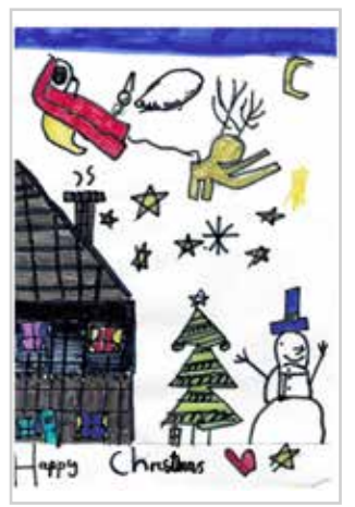
Amira age 7