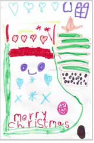
Edith age 5