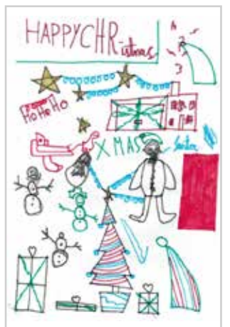
Reed age 7