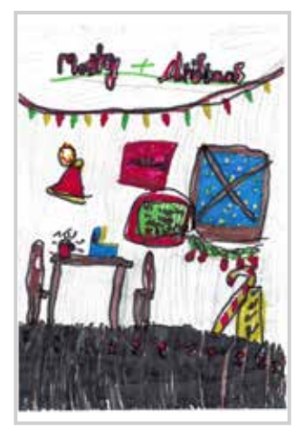
Bella age 8