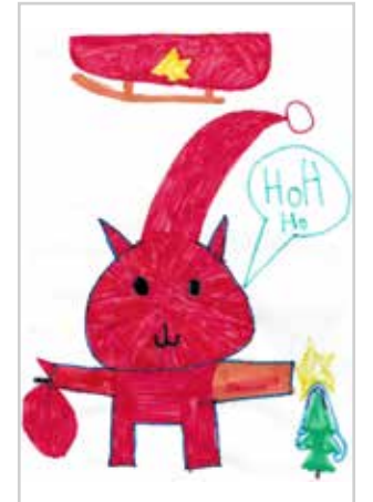
Oli age 6