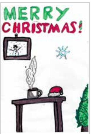
Artie age 9