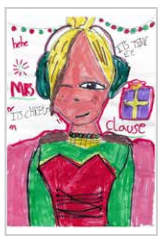
Evie age 10