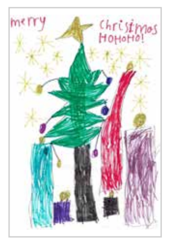
Acev age 6