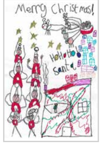
Florence age 7