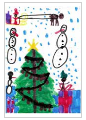
Theo age 9