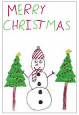
Mo age 9