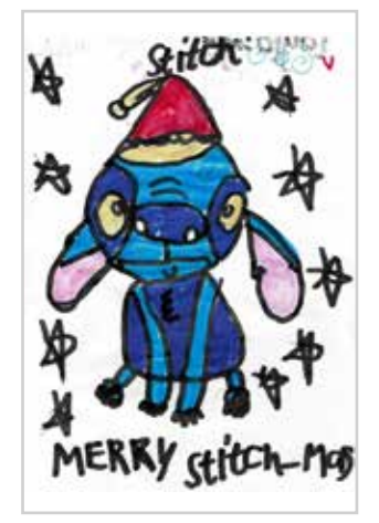
Layla age 11