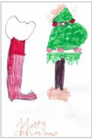
Rowan age 5