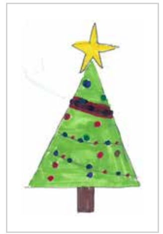
Kian age 10